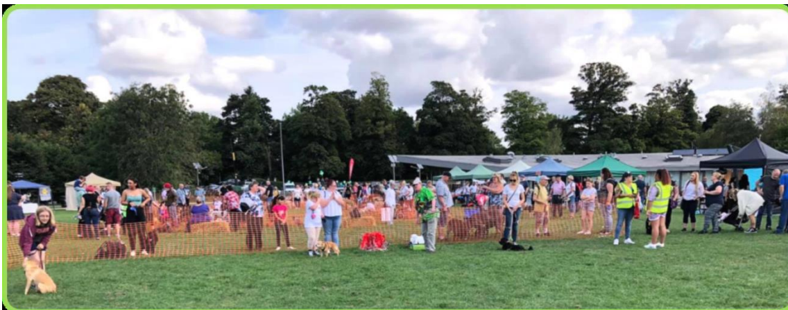
Image from the Dog Festival in September 2021.

The park are looking to set up a Houghton Hall Park constituted Friends of group. The group will form an independent constitution to vote in its own committee members deciding on aims and objectives on topics such as advancing the parks development by improving wildlife habitats, enhancing community engagement by educating people about conservation and heritage projects. They will help organise events and network with like-minded groups in the area.